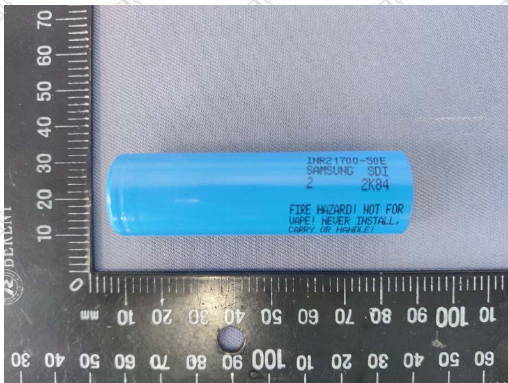
Figure 4 Overall view of cell (电芯图)