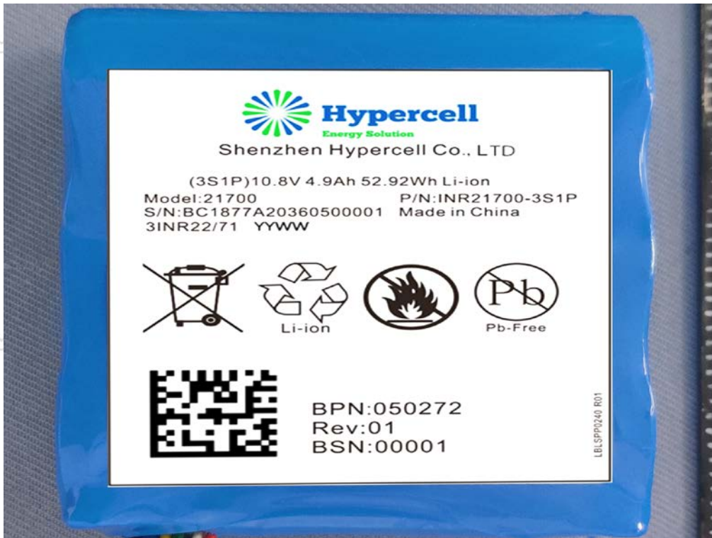
Figure 3 Battery Label (标签图)